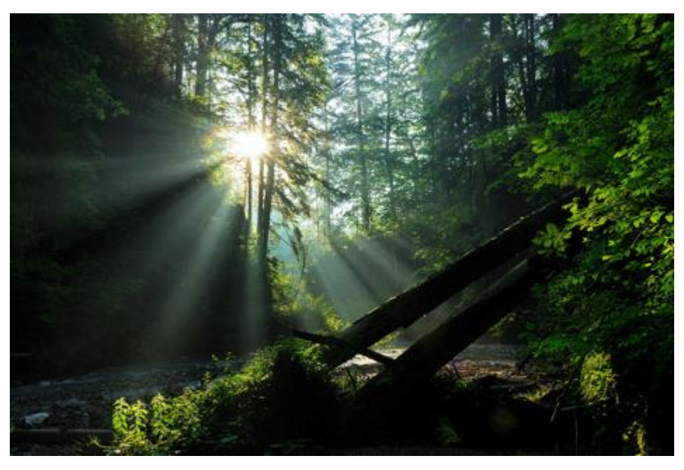
The Carpathian Mountains still host some of the wildest, most untouched natural areas of Europe

The establishment of the Carpathia Wilderness Reserve at the heart of the Romanian Carpathian Mountains is a unique conservation initiative in Europe. With support of a consortium of private philanthropists organised in the Foundation Conservation Carpathia (FCC), around 20,000 ha of forests and alpine grasslands have been purchased since 2009. The ultimate aim is secure 50,000 ha of mainly forests and integrating this area into the larger protected areas landscape of Romania. In parallel to purchasing land, FCC has started the restoration of degraded forestland and mountain streams and acquired hunting concessions to enable wildlife comeback. Work has also commenced to introduce a new, innovative forestry concept in the buffer zone - "the Lübeck forestry model" – and to assist local communities to start up nature-based enterprises and protect remaining old-growth forests. Although being subject to traditional human use for the last two centuries, the area still harbours some of the largest remaining tracts of primary, old growth forests in central Europe with many rare plant and animal species of great international importance.