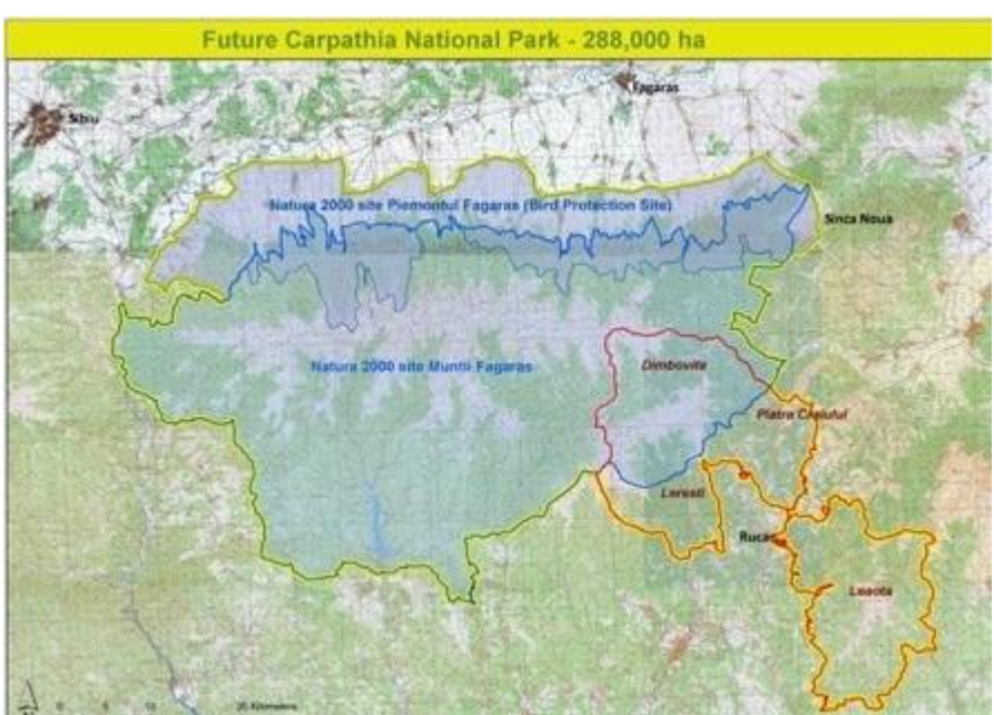
The upper map shows the location of the Carpathia Wilderness Reserve in the southern Carpathian Mountain range west of the town of Brasov, Romania. The FCC project area is situated in a much larger 288'000 ha area with the tentative name Carpathia National Park.