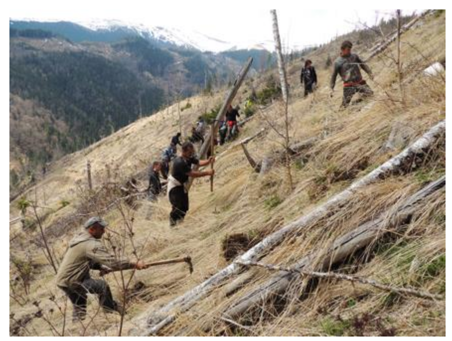
Replanting of clear cut mountain slopes organised by Foundation Conservation Carpathia and co-financed by the EU LIFE programme

A specific Carpathia Forest Management Concept have been adopted by the FCC to: