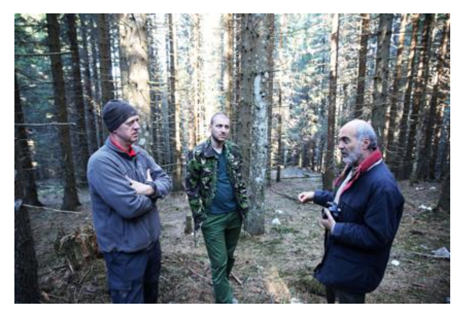
A hallmark, conservation approach of FCC is to be in constant dialogue with every sector of Romanian society, especially the local villages.

To develop a new economy around the future Fagaras National Park, FCC received financial aid from the EEA Grants to explore conservation values and business opportunities around the Făgăraș Mountains. Through this project FCC wants to evaluate the socio-economic and conservation context in the Făgăraș Mountains Natura 2000 site, the current on-going business activities, and to synthesise how they could be transformed into a new economy, which would assist in the full restoration of ecosystem services and biodiversity conservation. The project aims also to analyse the political framework for the development of conservation enterprises, and to come up with policy recommendations to foster such a development not just in the Făgăraș Mountains, but in other protected areas of Romania as well. This project will also provide the baseline for future monitoring of the socio-economic developments of the FCC work.