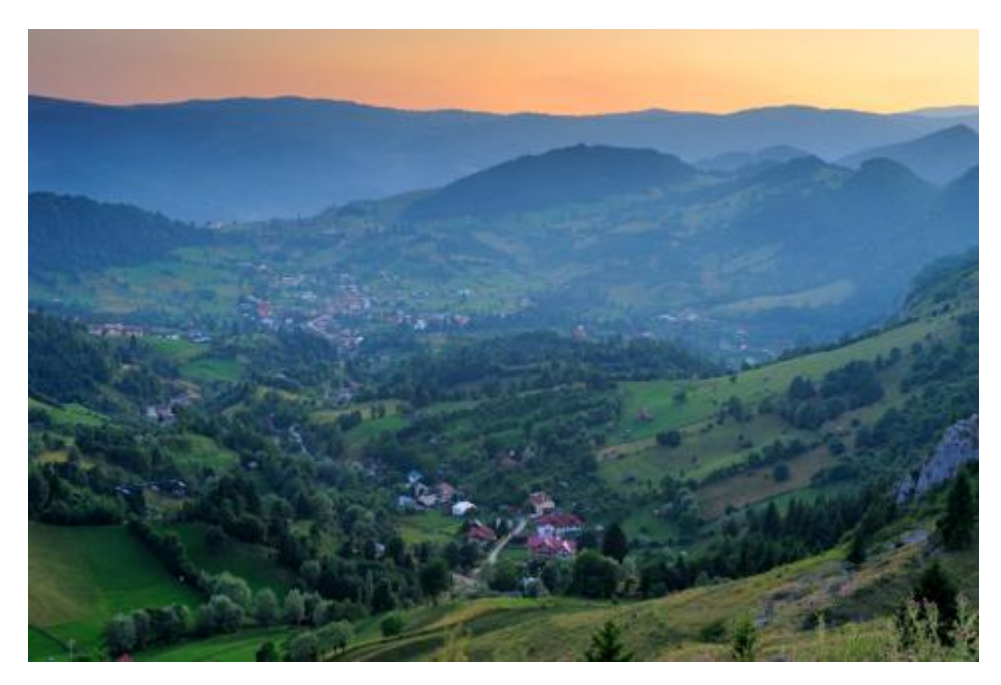
The Carpathia Wilderness Reserve is surrounded by old, traditional Landscapes where people have lived for generations, managing land. Through FCC, new, nature-based enterprise activities are being developed, creating additional economic activities.

management plans - as also required by the VCA - could guide future developments and decision-making at the same time as providing incentives for target-oriented investments benefitting the nature values.