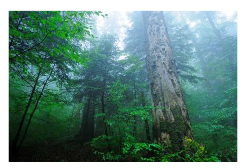
Old, natural forests are the most important conservation element in central Carpathian Mountains.

One of the most prominent values of the Carpathian Mountains in Romania is the concentration of old-growth/virgin and natural forests, which is among the highest in Europe. The project area is one of the large depositories of old-growth forests in Romania, although still facing many threats.<sup>5</sup>